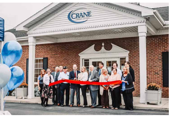
Spencer ATM/Drive-Thru 279 East Morgan Street | Spencer, IN 47460