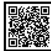
SCAN TO LEARN MORE!

Charles and Kelsey Carter encourage aspiring entrepreneurs to work hard and stay committed. Their success is not only about great flavors but about family, perseverance, and community impact. Scan the QR code to learn more about Carter's Sauces, and be sure to try one of their incredible sauces—you won't be disappointed!